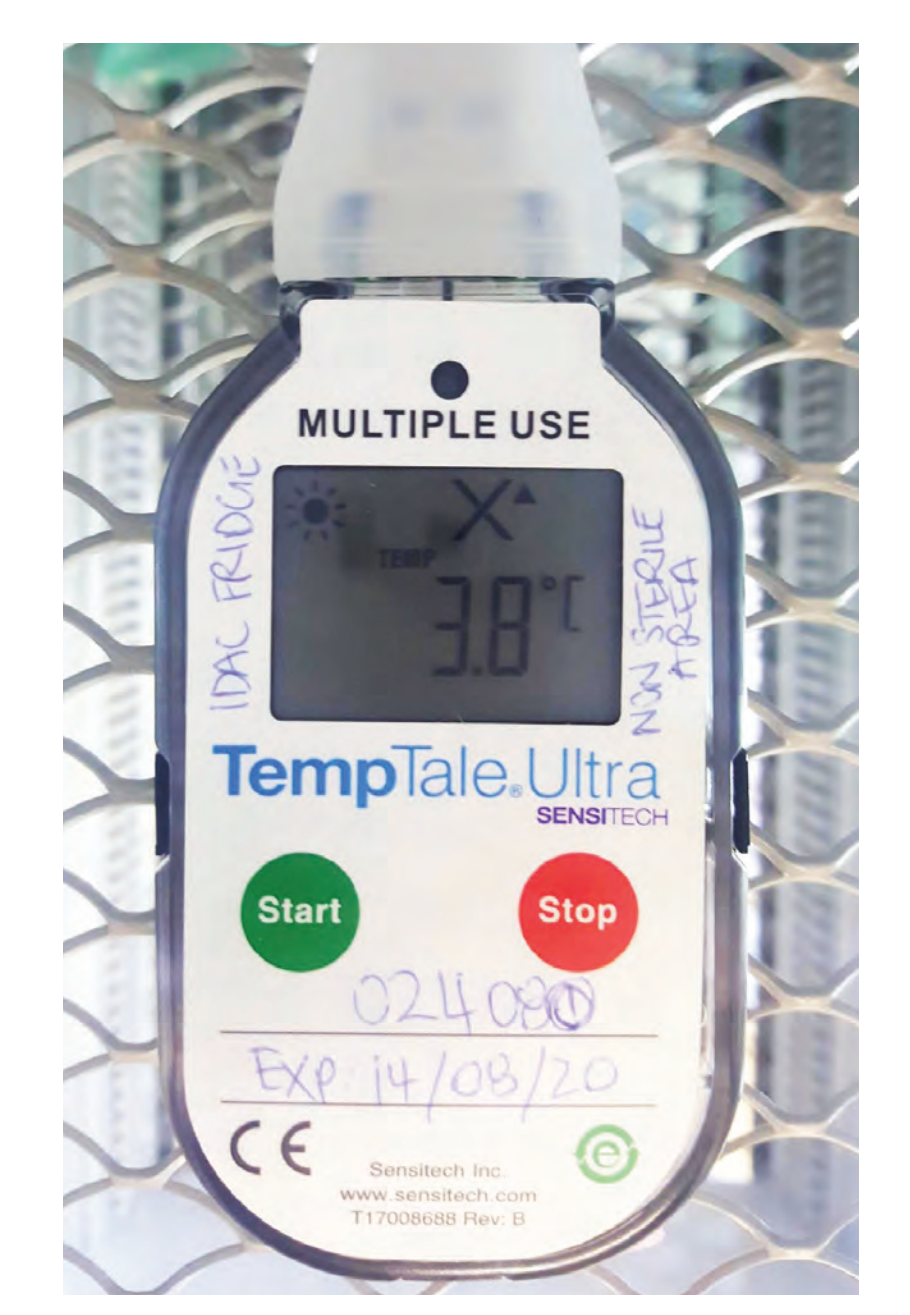
Figure 3: New Temperature Monitoring Devices

• Organisational skills and clear documentation are essential to keep track of communication with other pharmacy staff and drug companies contacted during the review of medications.